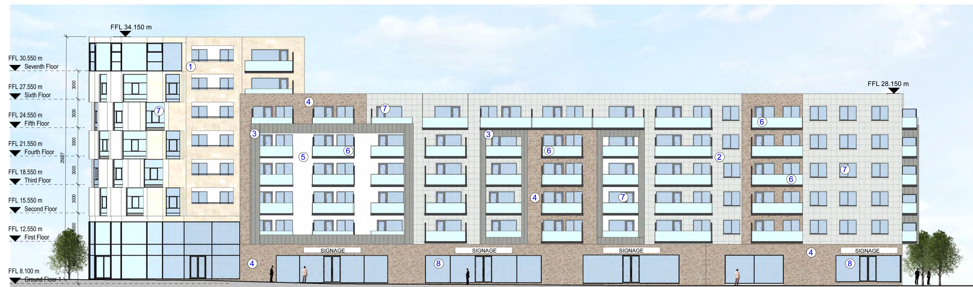
BLOCK B - SOUTH ELEVATION Scale 1 : 200

GENERAL NOTES - ** Do not scale from this drawing *** Use figured dimensions only © This drawing is copyright. No part of this document may be reproduced or transmitted in any form or stored in any retrieval system from the copyright holder, except as agreed for use on a project, for which the document was originally issued.