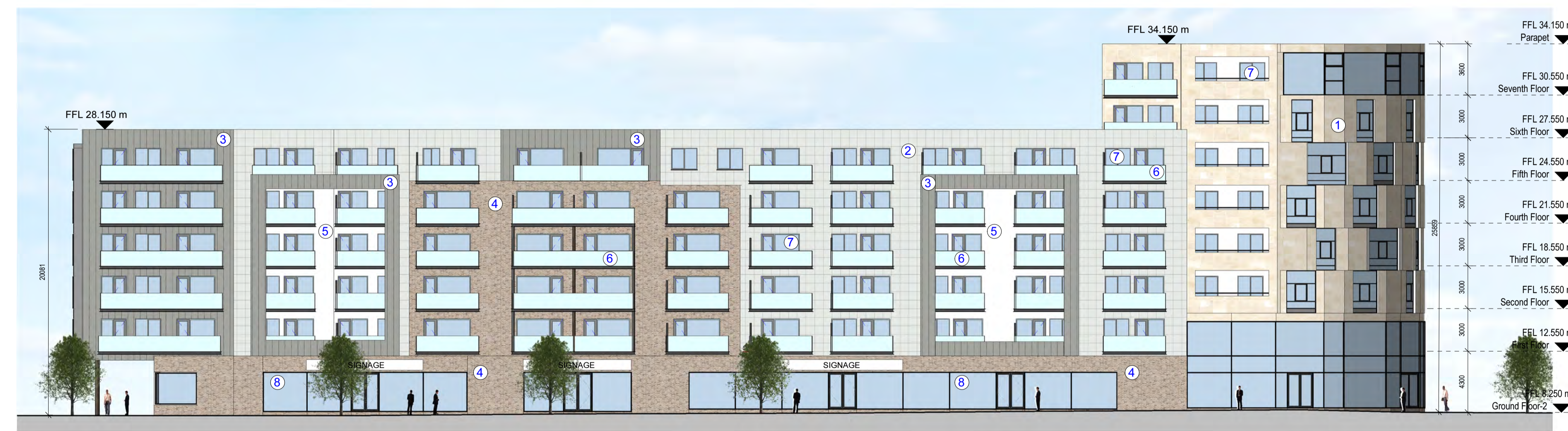
BLOCK B - WEST ELEVATION Scale 1 : 200

NOTE: ALL MATERIALS TO BE AGREED BY WAY OF COMPLIANCE WITH COUNCIL