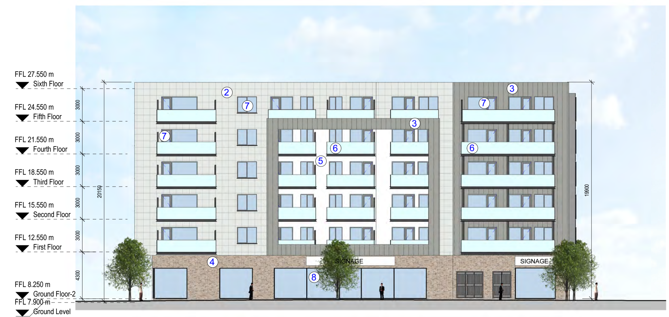
BLOCK B - EAST ELEVATION Scale 1 : 200